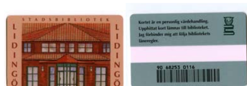
Standard library cards or any other ID-card can be used.

The books are placed where it is most suitable from a space management perspective. This means that the capacity of the machine can be optimised at all times.