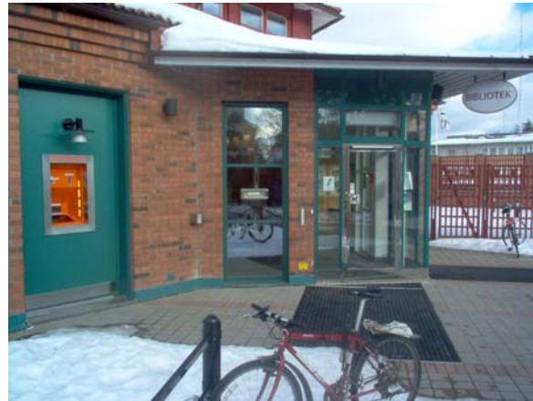
A stylish implementation at Lidingö Stadsbibliotek in Sweden.

BOKOMATEN® is available 24 hours a day, 365 days a year. It is accessible through the internet and it can communicate through e-mail and SMS.