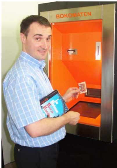
The library card gives access to BOKOMATEN®

The borrower identifies himself with his normal library card or any other form of ID-card that the library may be using. He makes his choices among the titles available in the storage unit directly on the touch screen of the machine. The book is delivered through the gate in front of the machine and a receipt is printed.